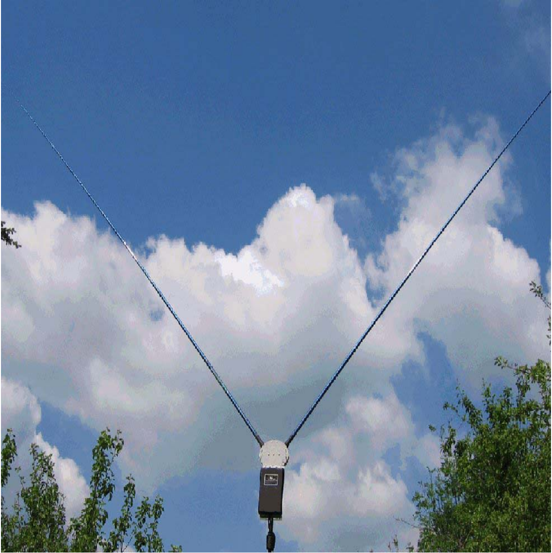
Tuner is CG-3000 with balun