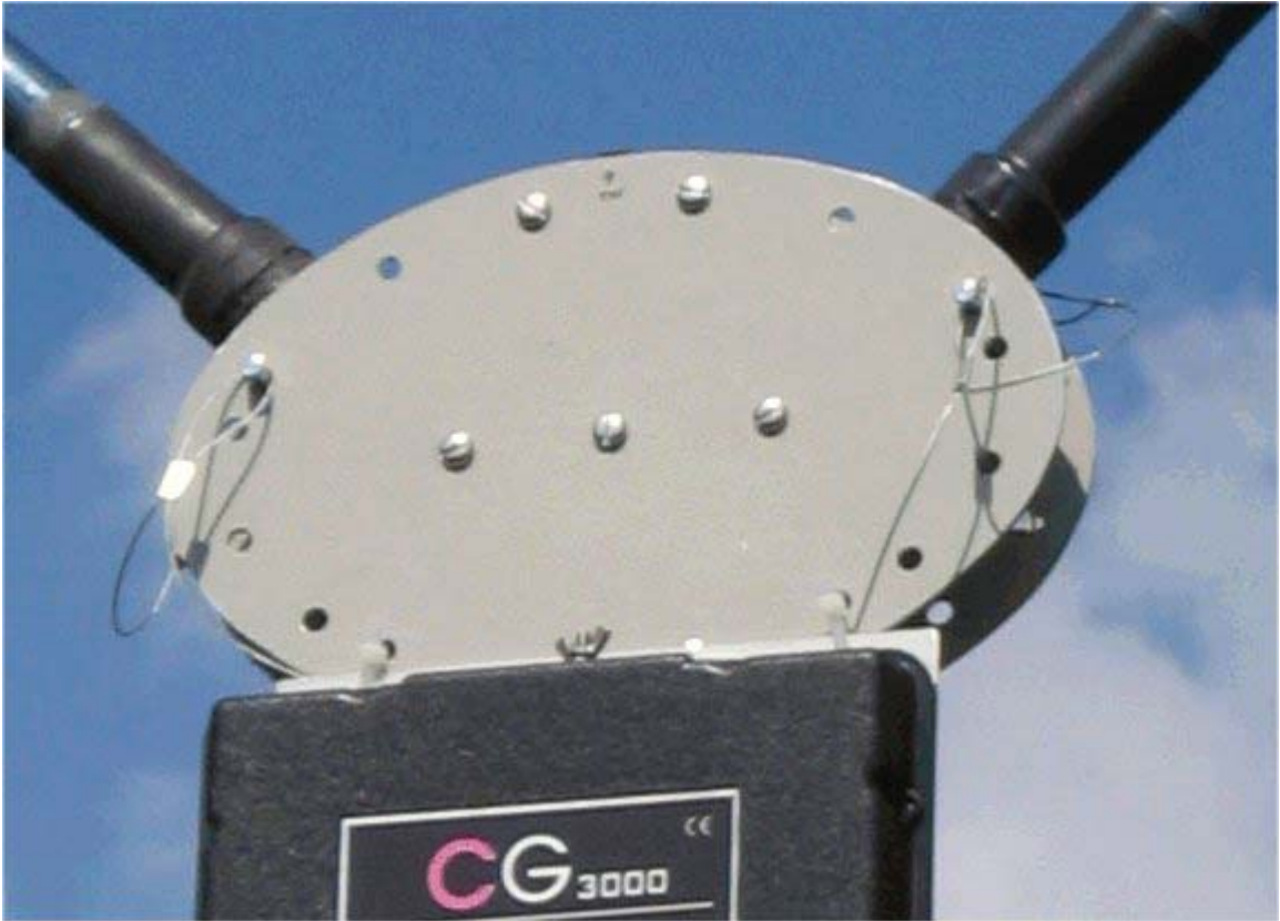
Tripod is a 3m high lighting stand