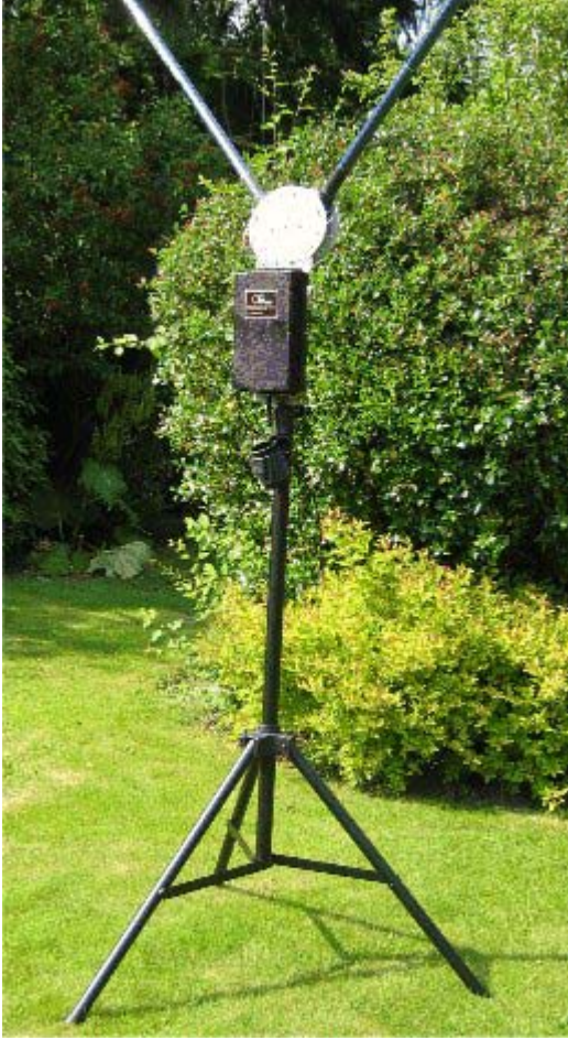
Poles are 6m fishing rods reinforced at end